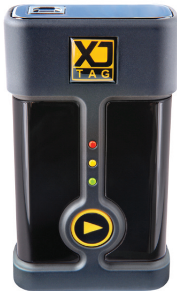
Available in black and yellow.*