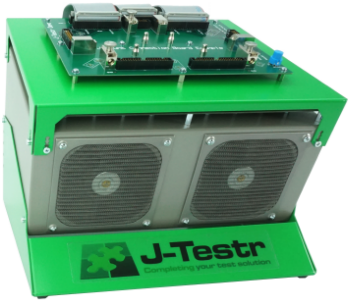
Picture: J-Testr with UUT mounted on top mounting plate

includes all supplies, IO, DAC, signal generators, communication lines, etc. A dedicated "Go-J-Safe" input signal is available on all peripheral cards, allowing the user to expand, if required, this powerful safety system to give ultimate UUT protection.