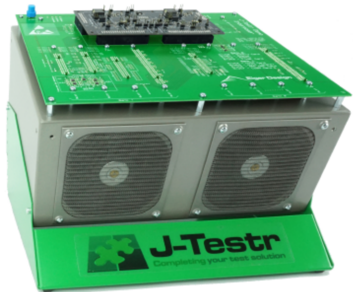
Picture: J-Testr fitted with demonstration interposer

Eiger Design can provide a full fixture solution with J-Testr+